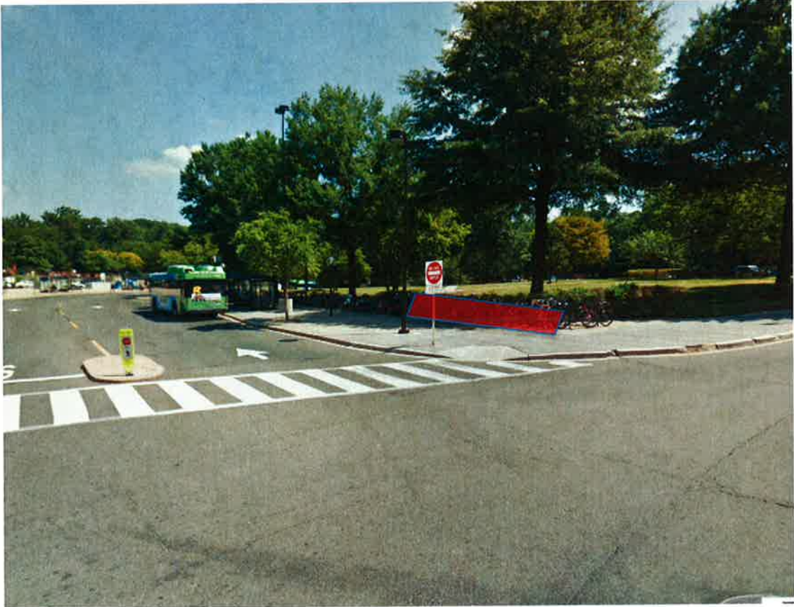
Cedar Street at Metro Entrance